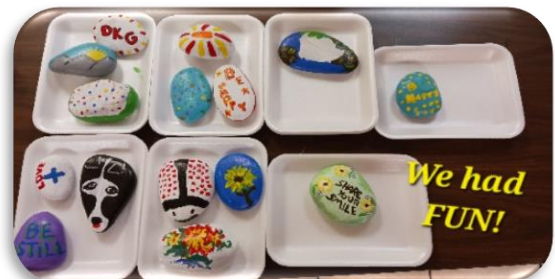
We had FUN!