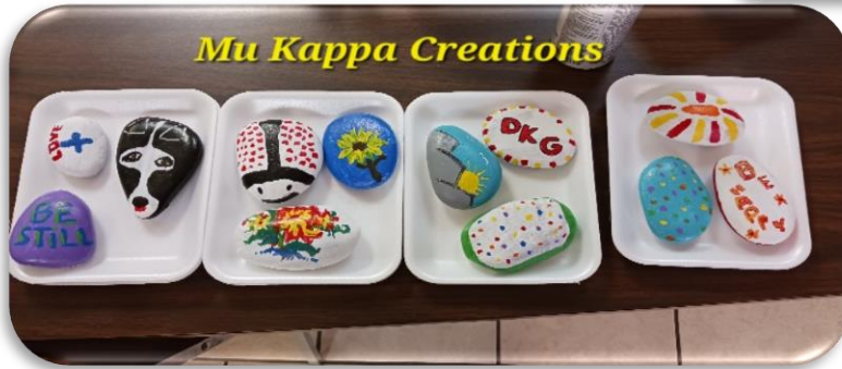
Mu Kappa Creations